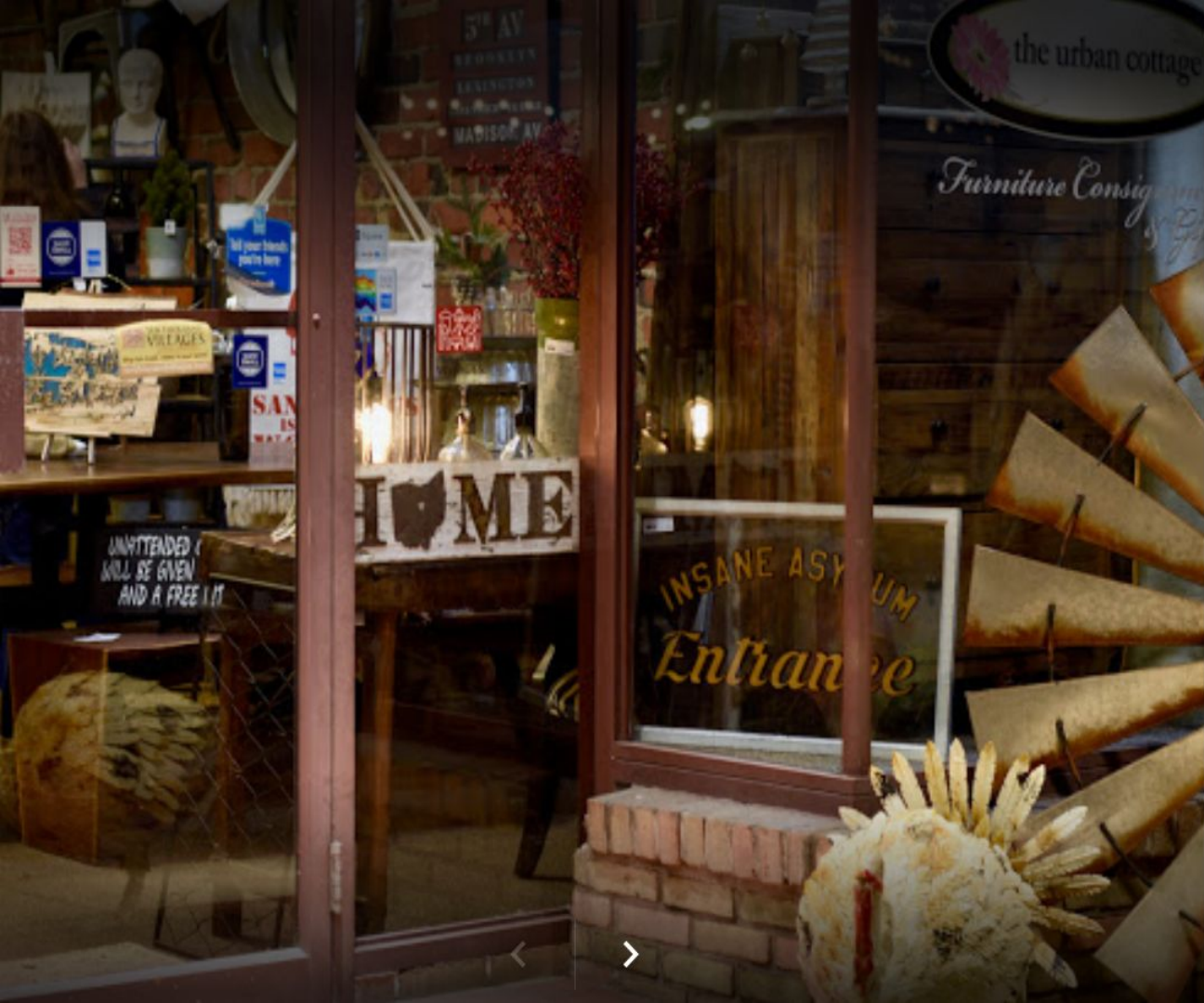
The Urban Cottage