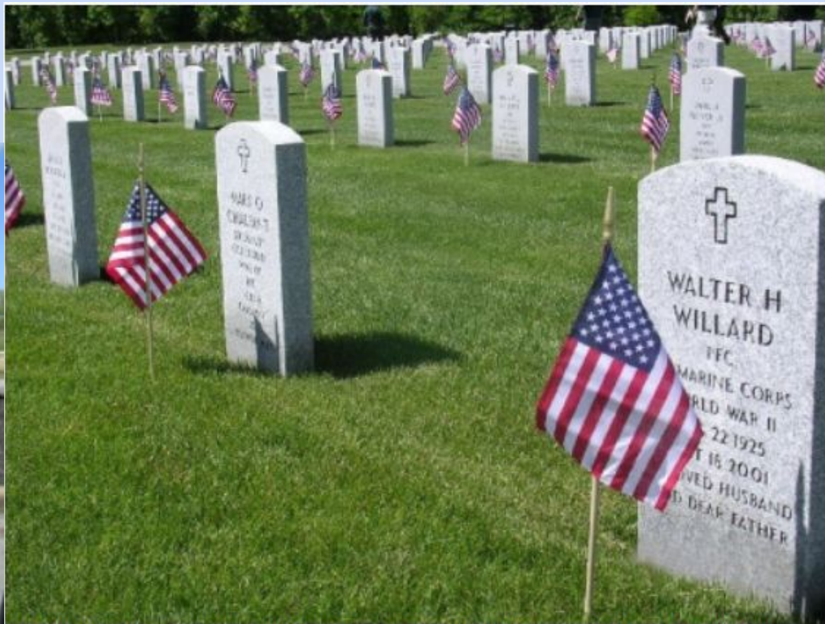
Headstones decorated for Memorial Day at Ohio Western Reserve National Cemetery.